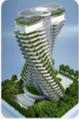
[AGORA Tower, Taipei, Taiwan]