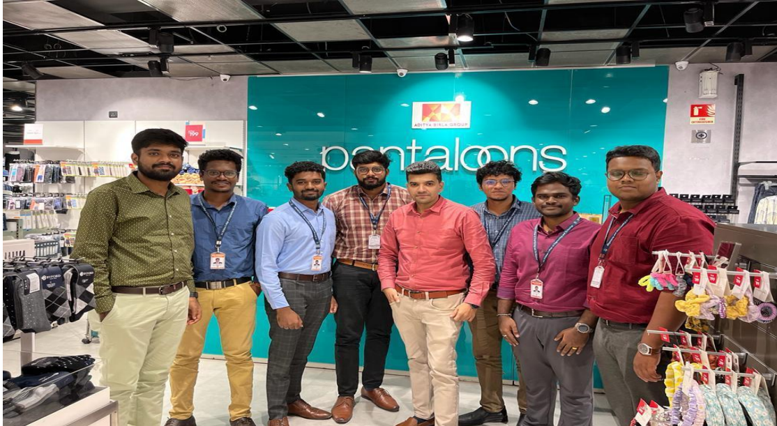
Table Talk programmes are conducted so that students interact with the high-level senior executive of various streams on one-to-one basis to orient them towards the social and physical conditions of the organisation.