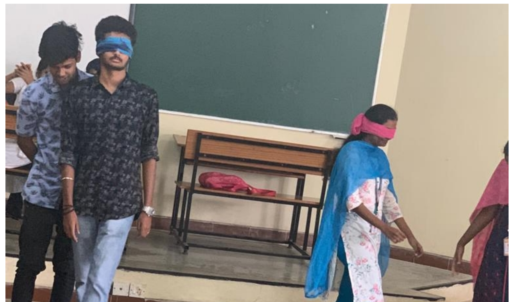
Extended Hour Activity - BlindFold Object Finding