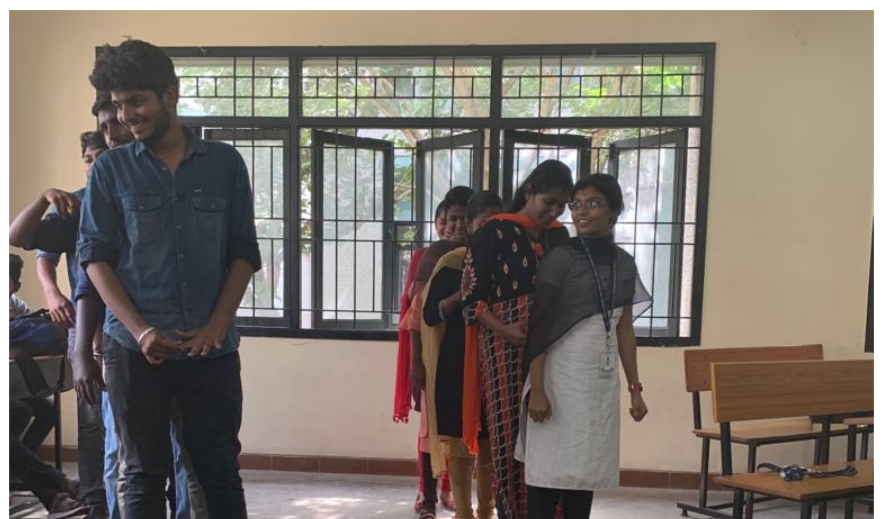
Extended Hour Activity - Balloon Walking