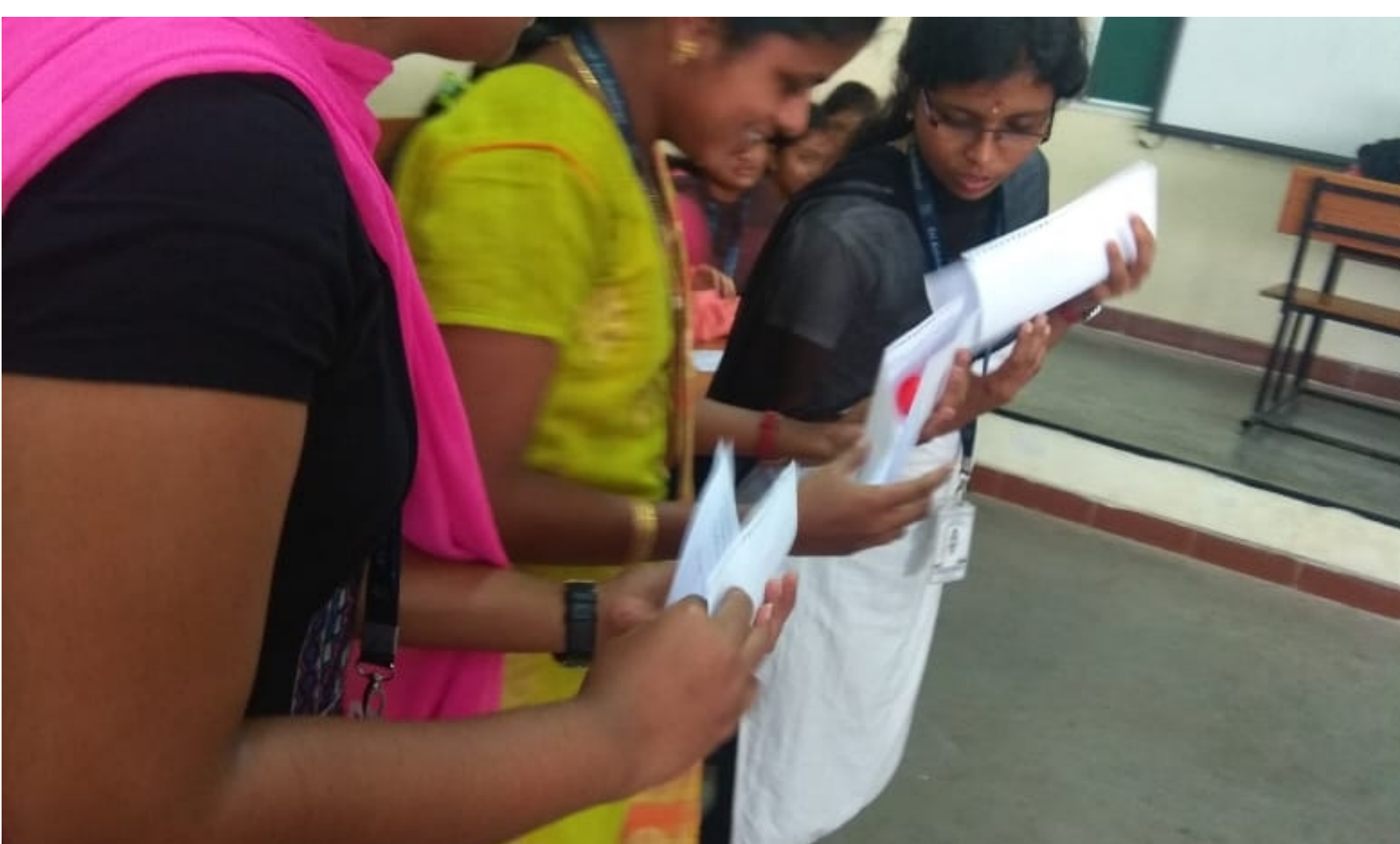
Extended Hour Activity - Dropping Ball Forming Paper Tower