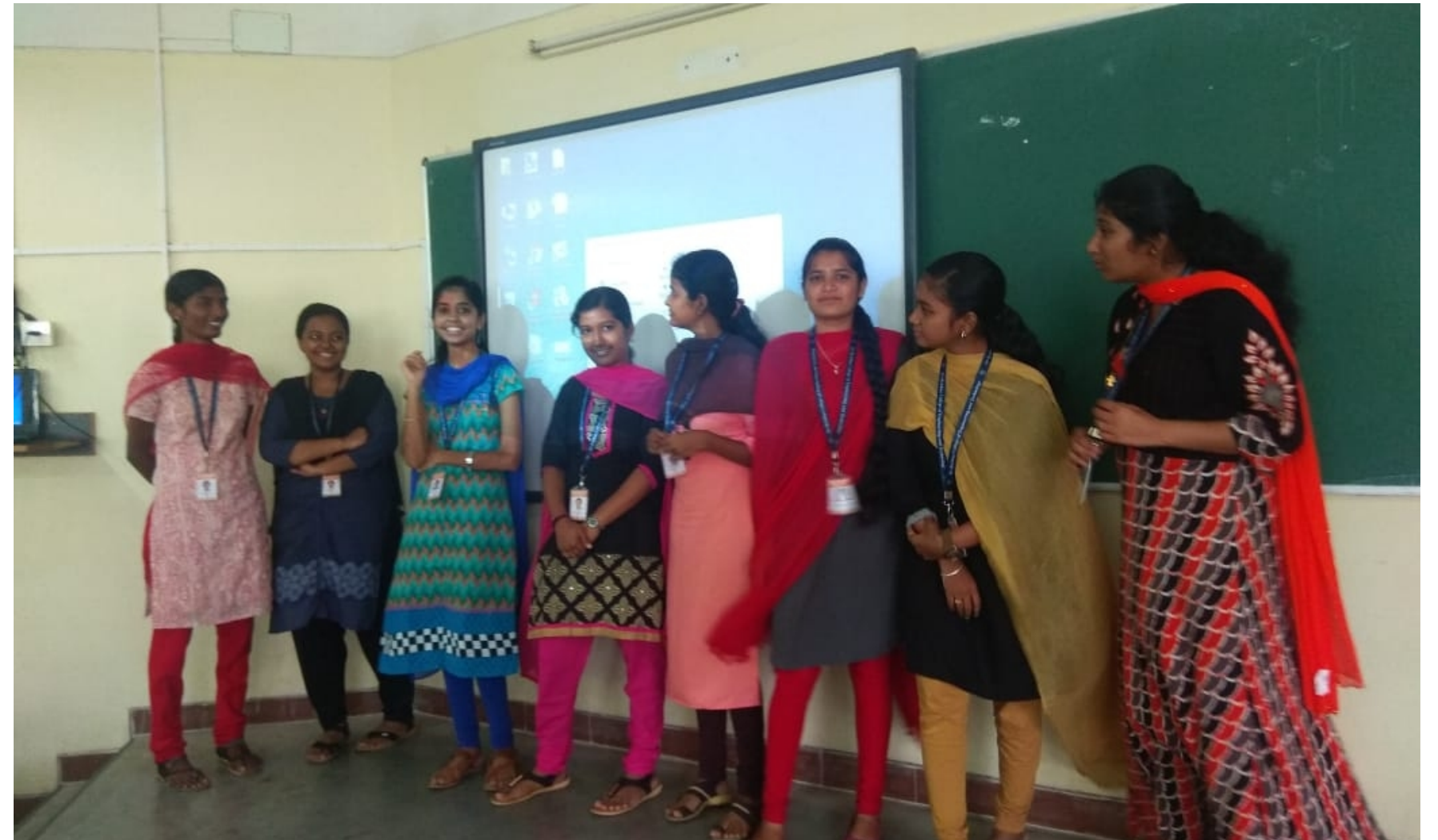
Activity Day - Debate