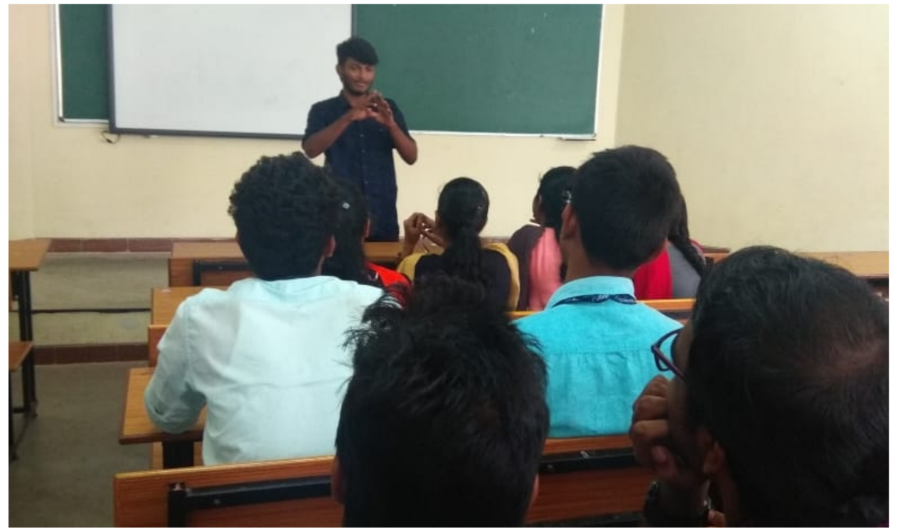
Team Building Activities