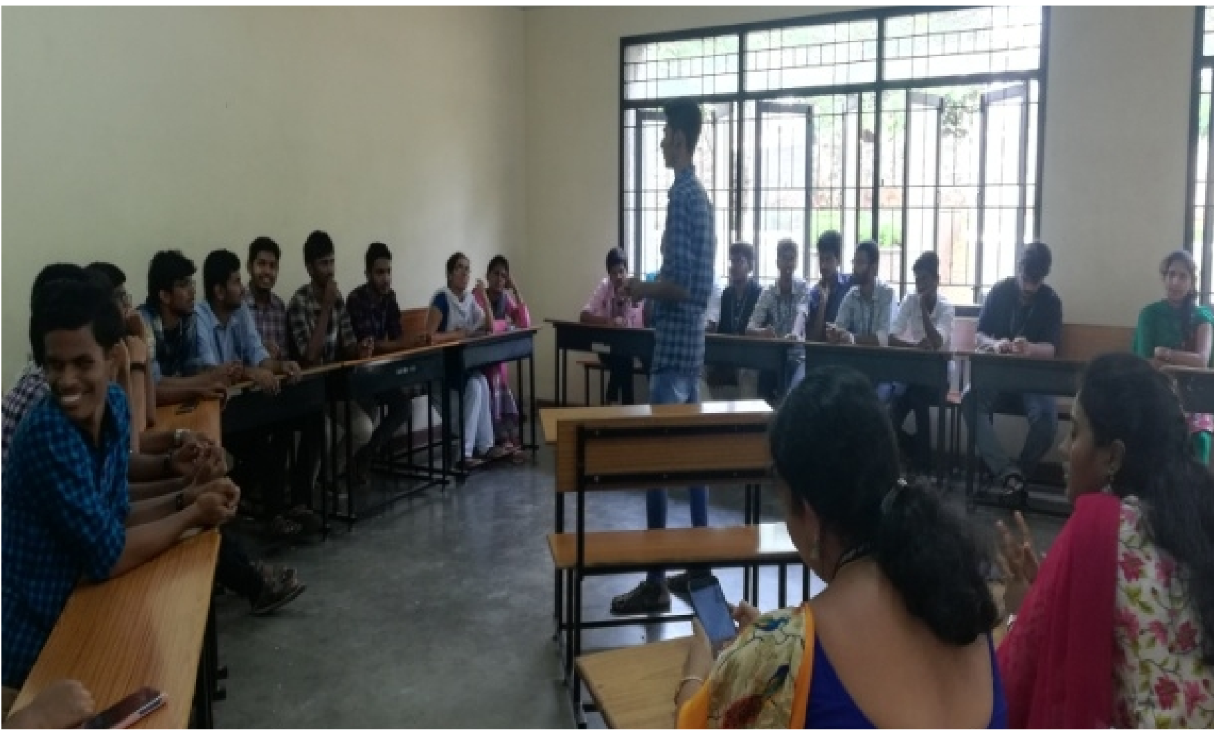
Activity Day - Debate