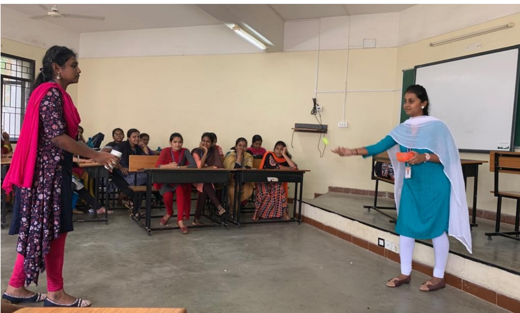
Extended Hour Activity - Role Playing