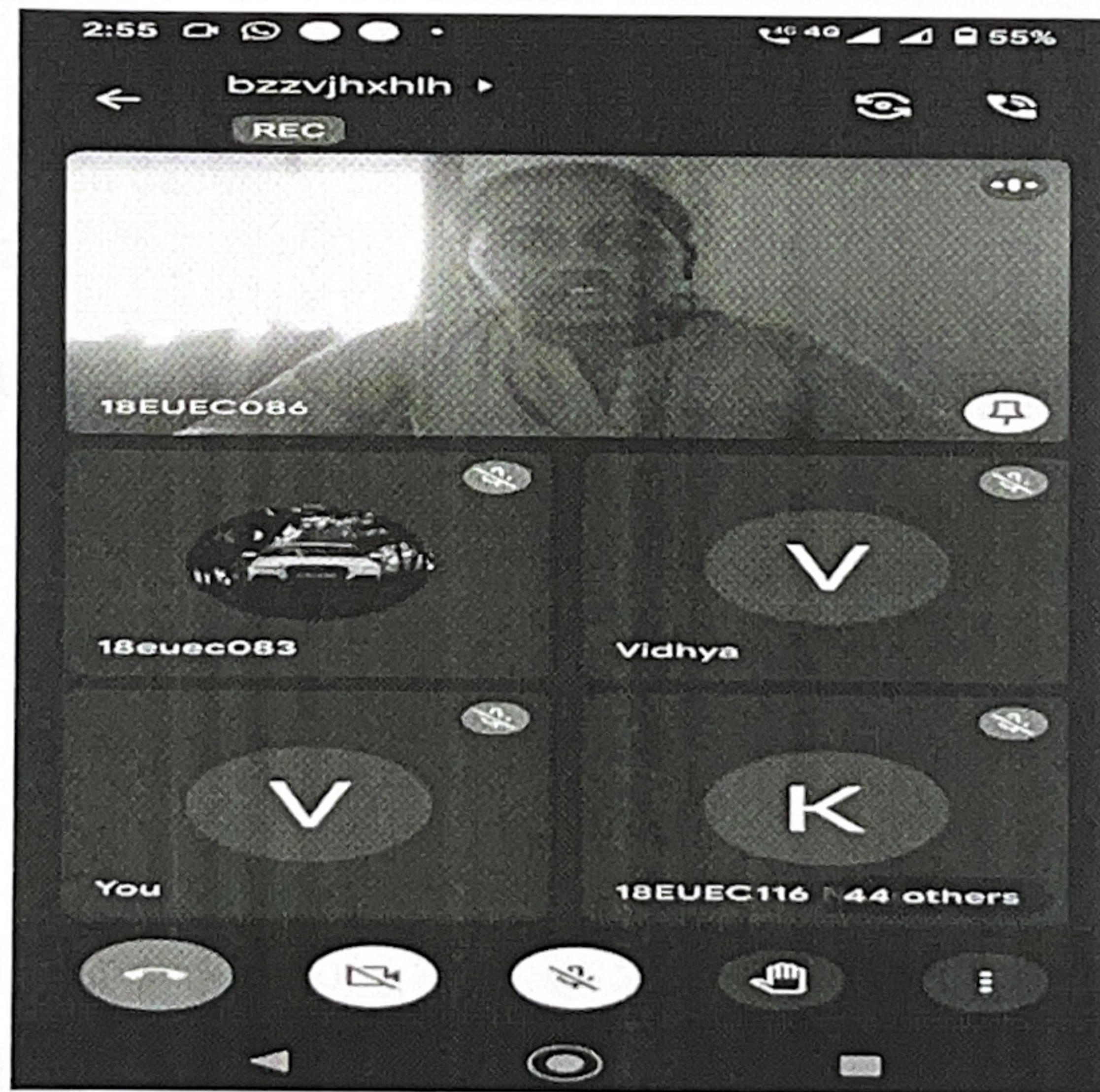
Students attending the Women Grievance Redressal meeting