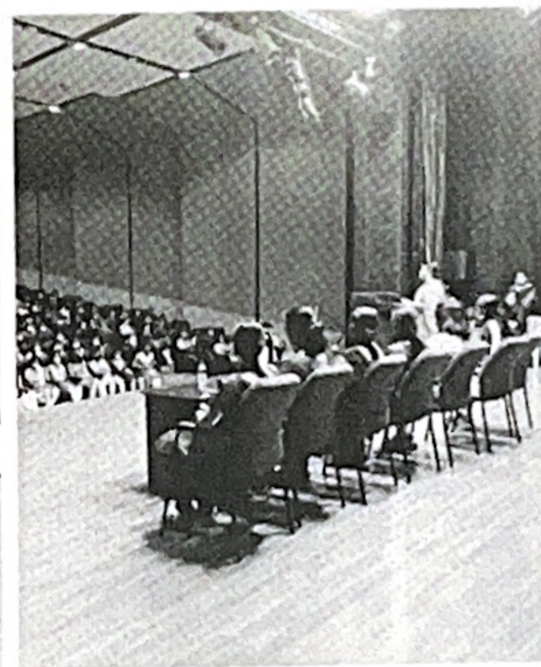
Students Attending Women Hygiene Management Programme