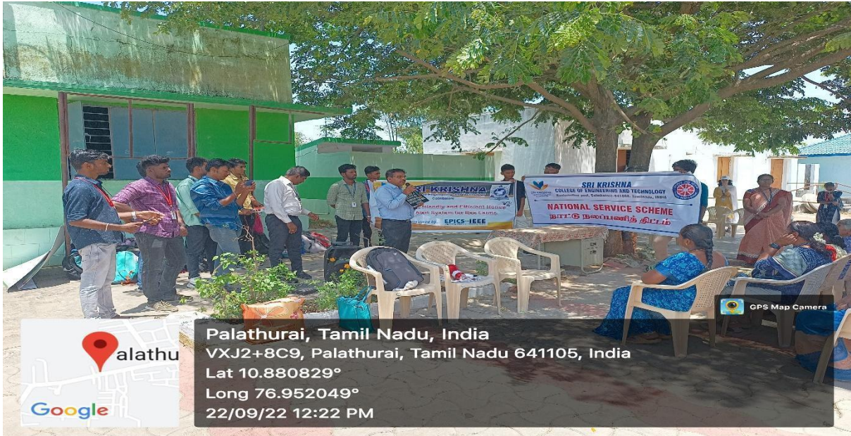
Explaining Honey Harvest Alert System to the Farmers of Palathurai Village on 22.09.22