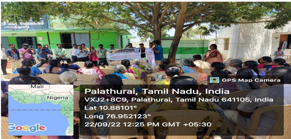
Demonstration of Honey Harvest Alert System to the Farmers of Palathurai Village on 22.09.22