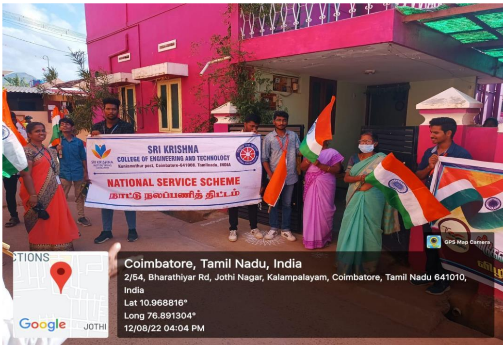
The ICOP awareness rally at Theethipalayam on 12.08.2022