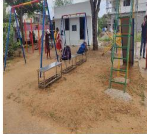
Children play area before and after cleaning by our NSS Volunteers