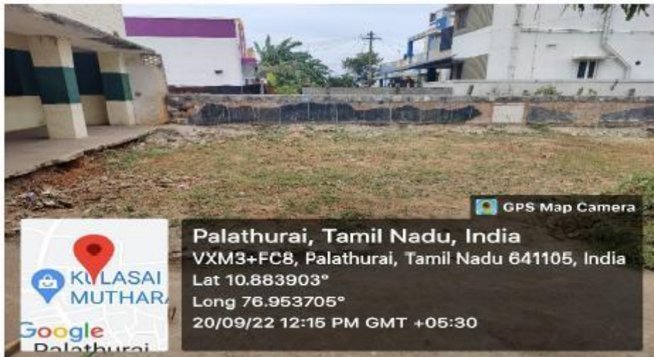
School ground before and after cleaning by our NSS Volunteers