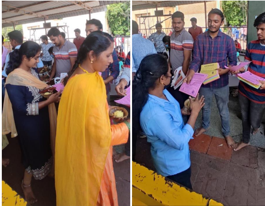
NSS Team distributes pamphlets to pilgrims on Cleanliness at Marudhamalai Temple on 20.11.2022