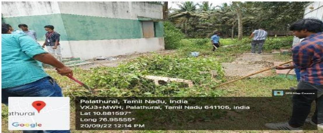
Cleaning activity at Palathurai Village on 20.09.2022