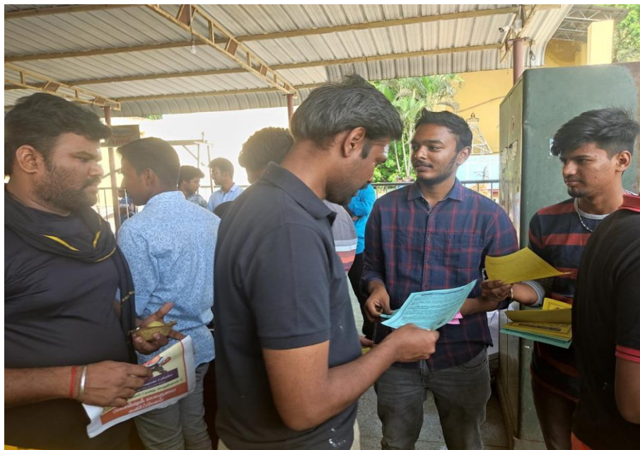
Cleanliness Activity at Marudhamalai Temple on 20.11.2022