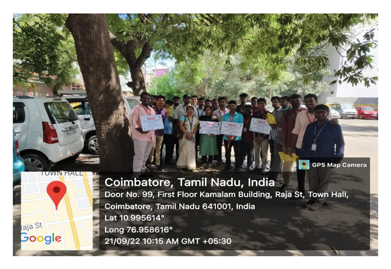
Students with Stickers from the corporation which insists that they should not use plastic bags