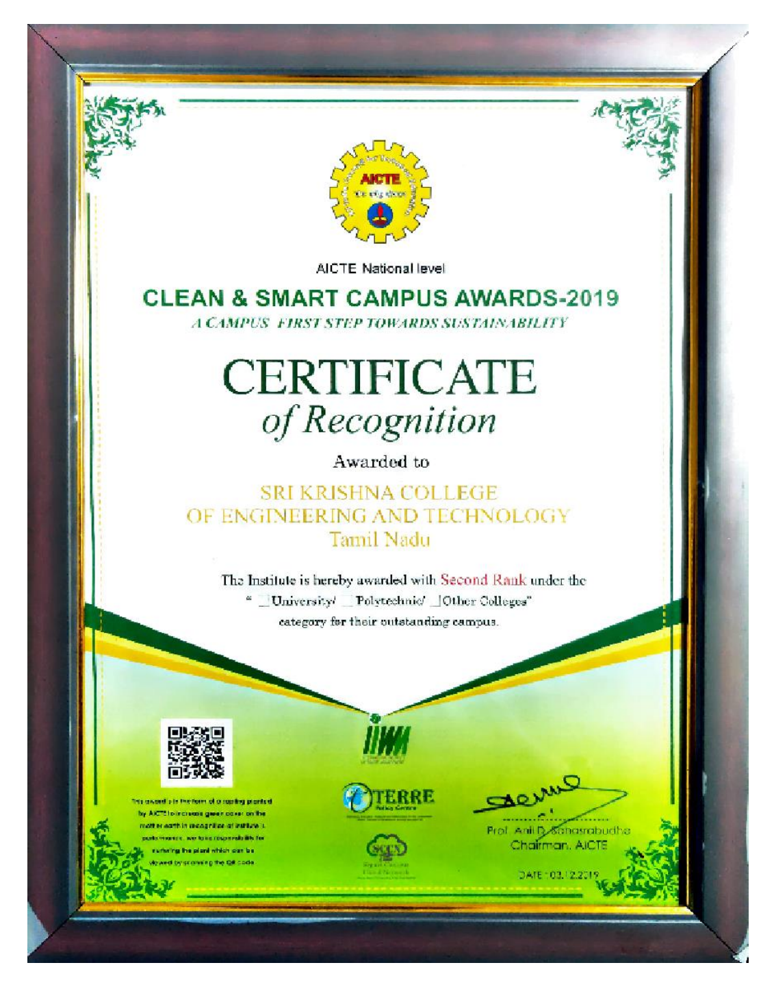
Clean and Smart campus award by AICTE for the year 2019

An Autonomous Institution Approved by AICTE Affiliated to Anna University Kuniamuthur, Coimbatore - 641008