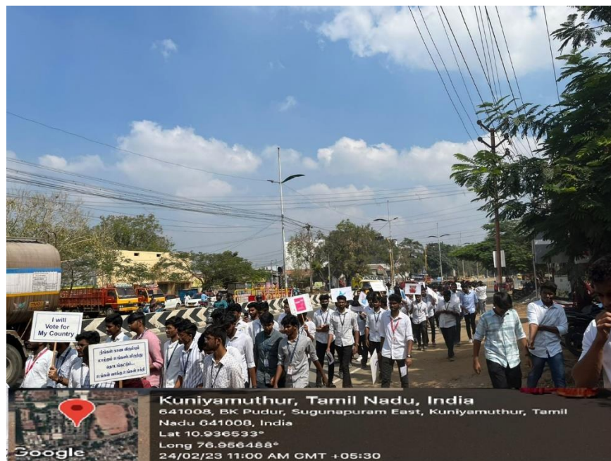
Awareness Rally On Raise Your Voice Through Your Vote