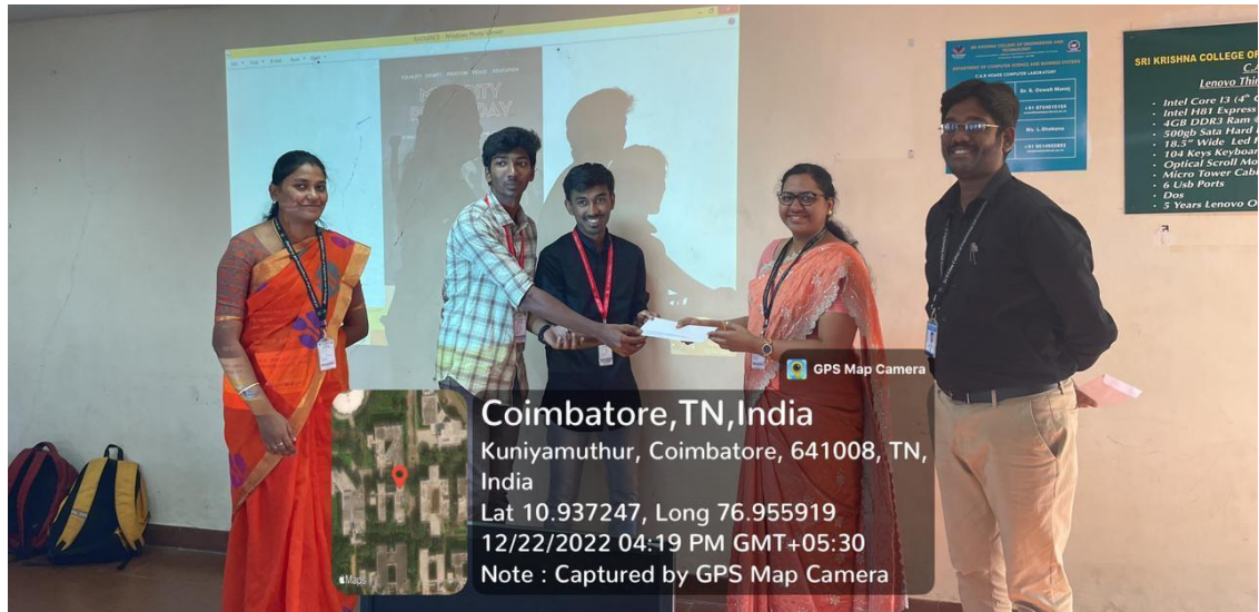
Minority Rights - Poster Design Presentation for College Students on 22.12.22