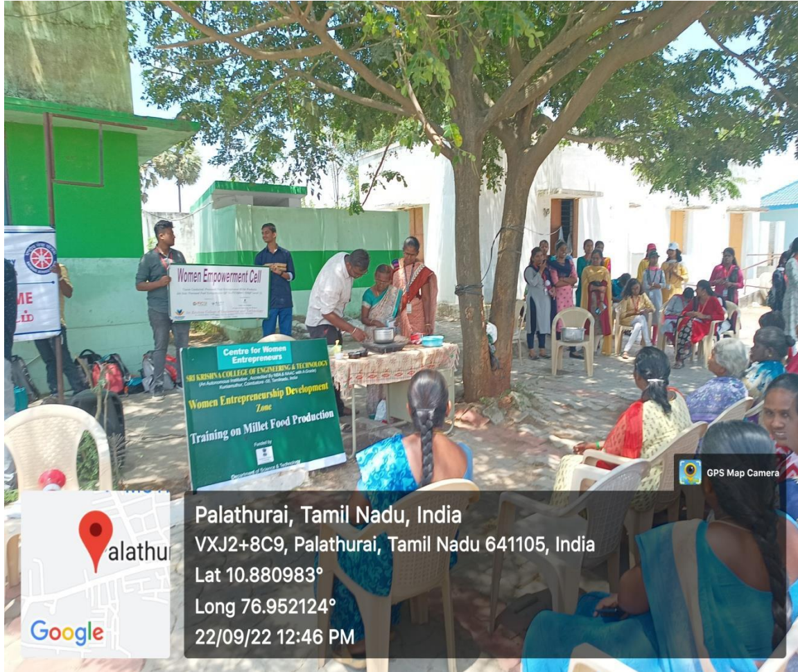
“Training on Millet Food Production – Healthy Living” on 22.09.22 in and around Palathurai area in order to create an awareness on health.