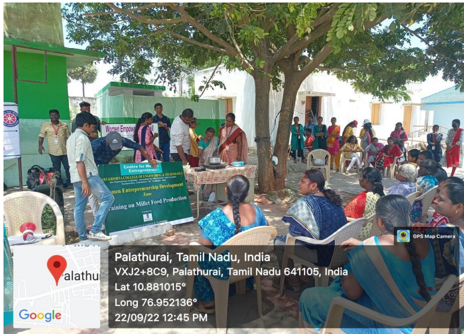
Training on millet food production at Palathurai village – Healthy living on 22.09.2022