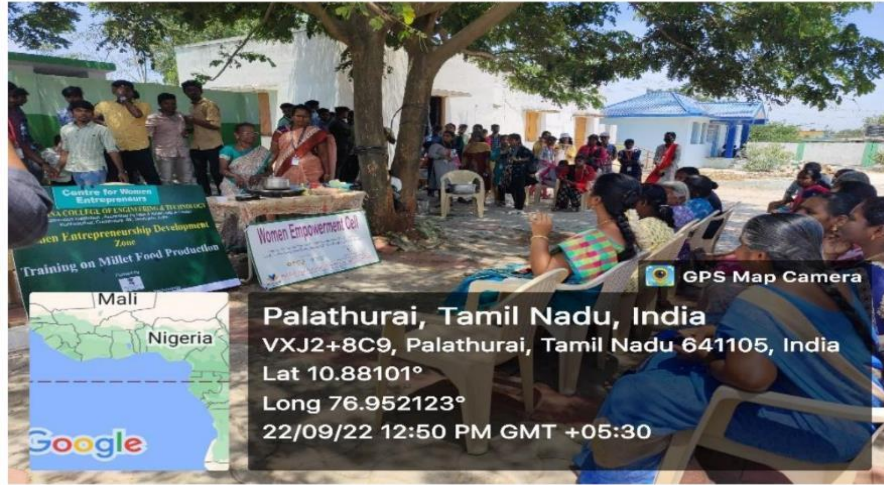
Training on millet food production at Palathurai village – Healthy living