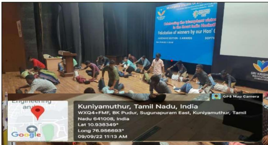
Students actively indulged in the BLS event practice session in College to participate at Tamil Nadu Agricultural University (TNAU) campus on 10.09.2022