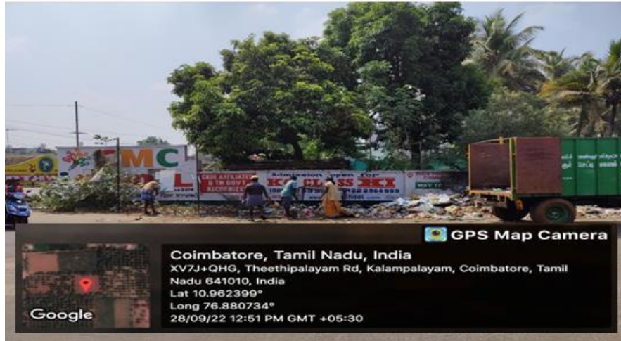
Corporation Workers cleaning at the City outskirts