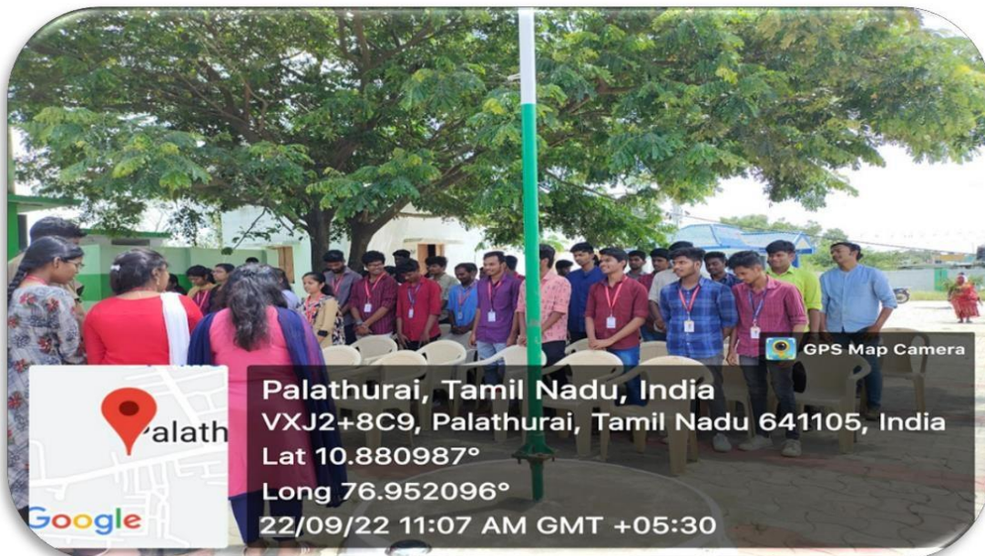
VAO felicitated by Our NSS Officer