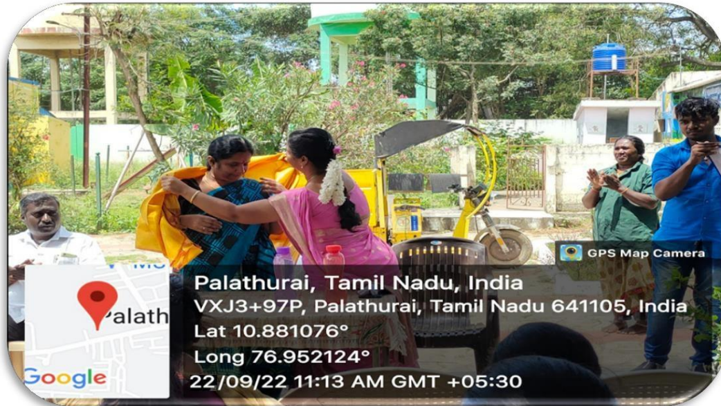
Awareness Campaign at Palathurai Village by Our College Students