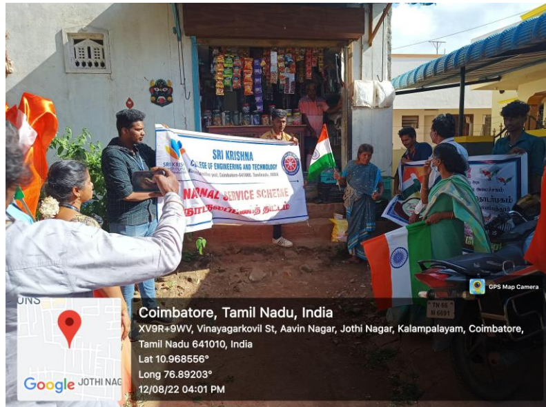
Awareness on Disease Prevention And Healthy Life Style - "Azadi Ka Amrit Mahotsav (AKAM)" on 12.08.2022 at Theethipalayam village