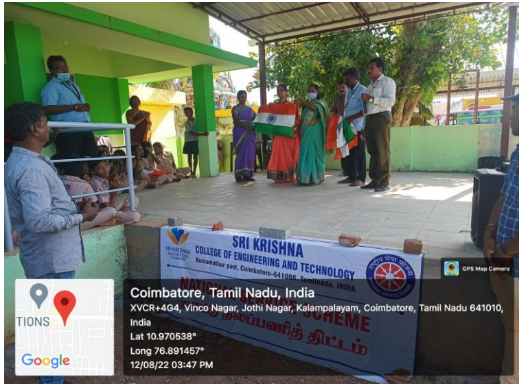
Disease Prevention And Healthy Life Style - "Azadi Ka Amrit Mahotsav (AKAM)"