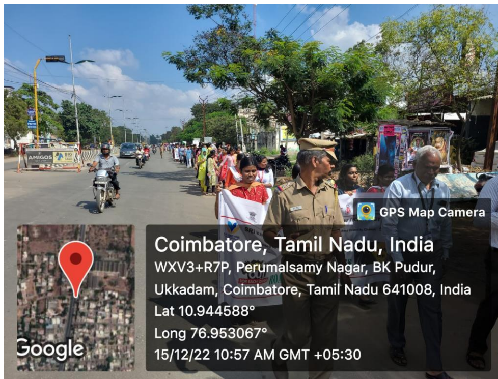
Awareness Rally on Fit India Freedom Run 3.0 about Fitness in B.K Pudhur on 15.12.2022