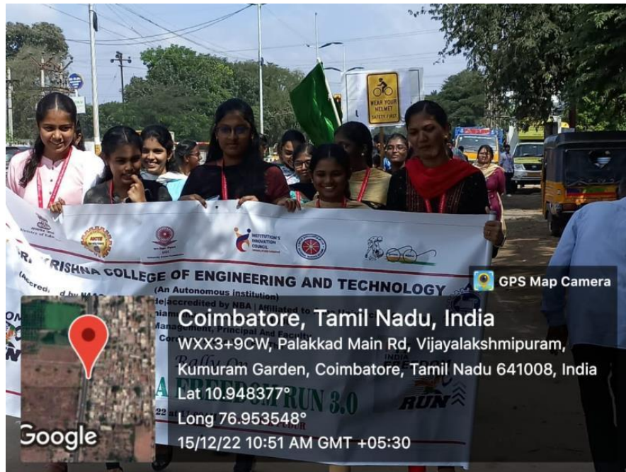
Awareness Rally on Fit India Freedom Run 3.0 about Fitness in B.K Pudhur on 15.12.2022