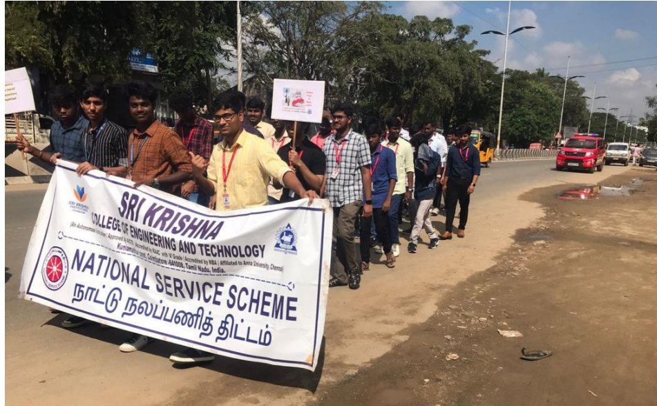
Students participation on awareness Rally on Fit India Freedom Run 3.0 about Fitness in B.K Pudhur on 15.12.2022