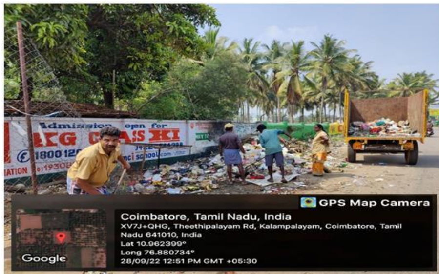
Corporation Workers cleaning at the City outskirts – Theethipalayam Village