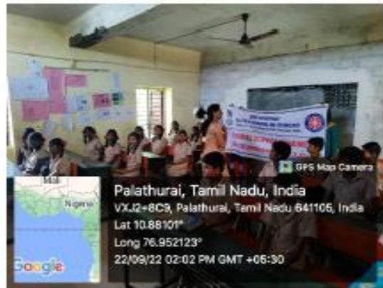
Awareness on Child Abuse at Palathurai Government School on 22.09.2022