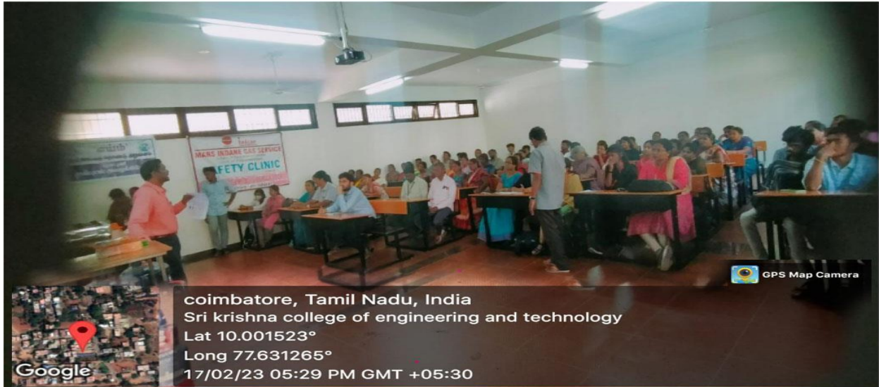
Fire Safety (IOCL and Mars Indane) to Self Help Group” on 17.02.2023