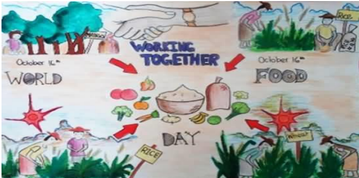
Drawing Competition title- Our Actions Are Our Future- Better Production, Better Nutrition on 26.10.2022