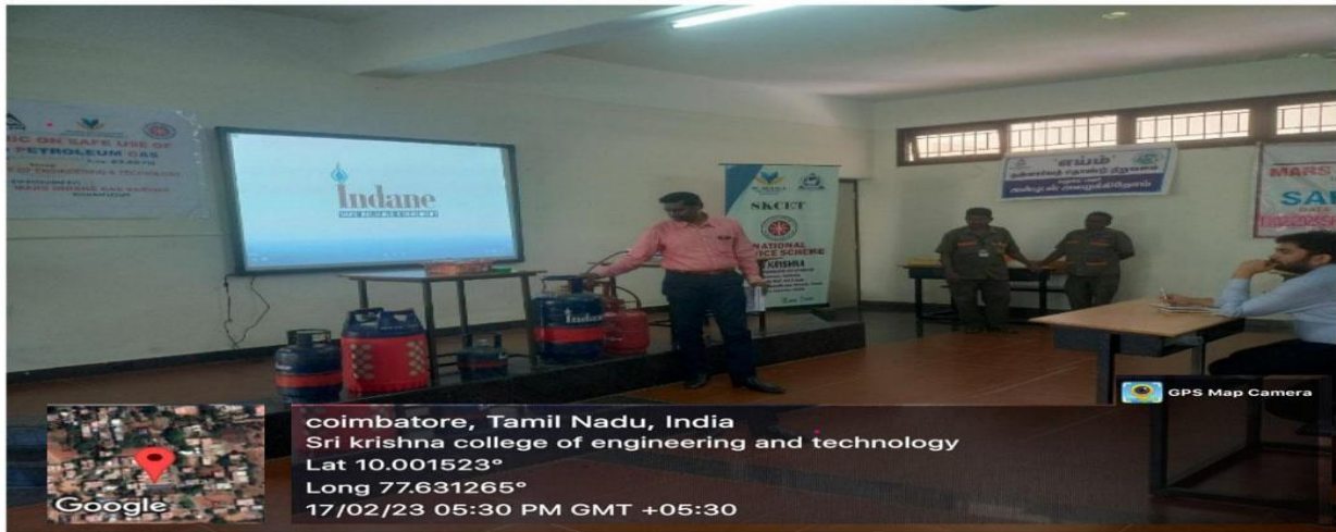
Fire Safety (IOCL and Mars Indane) to Self Help Group” on 17.02.2023