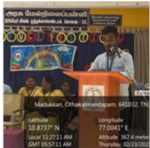
Science Project Expo for School Students at Government Higher secondary school, Othakalmandapam on 23.02.23