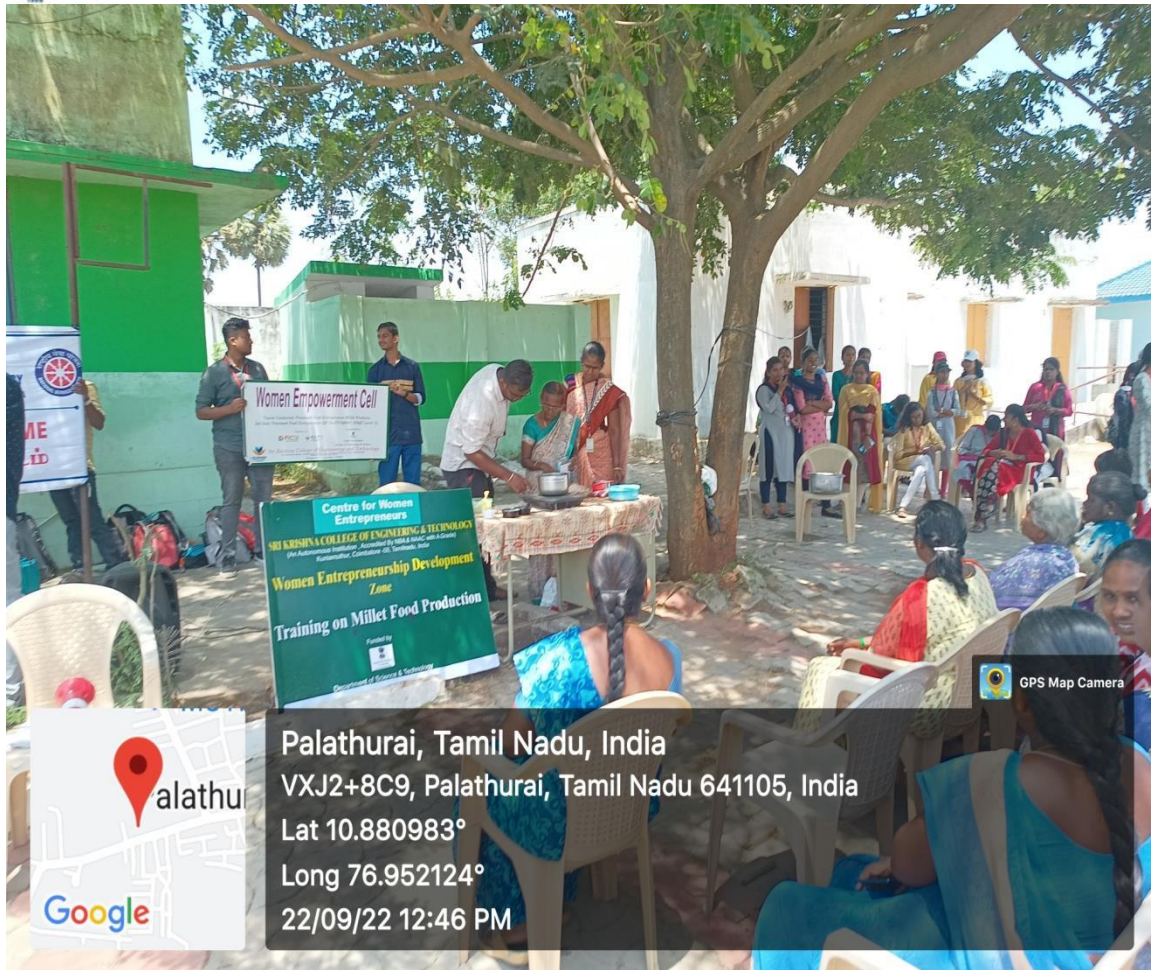
“Training on Millet Food Production – Healthy Living” on 22.09.22 in and around Palathurai area in order to create an awareness on health.

An Autonomous Institution | Approved by AICTE | Affiliated to Anna University, Chennai