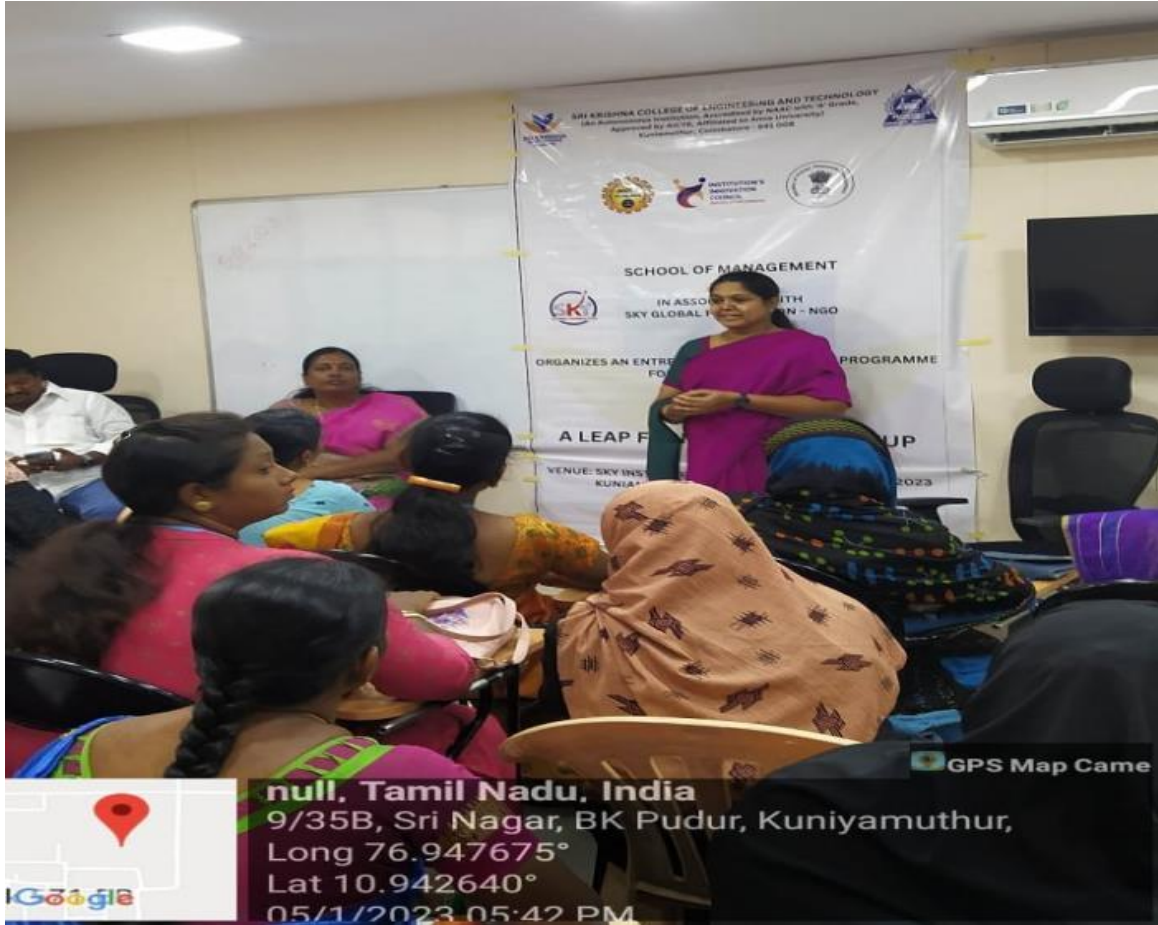
Entrepreneurial Training programme for Self help group women members on A leap from idea to startup