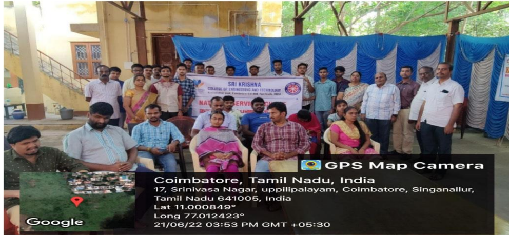
Mathematical Skill Development training camp for visually challenged people taking Group IV Exam on 21.06.22