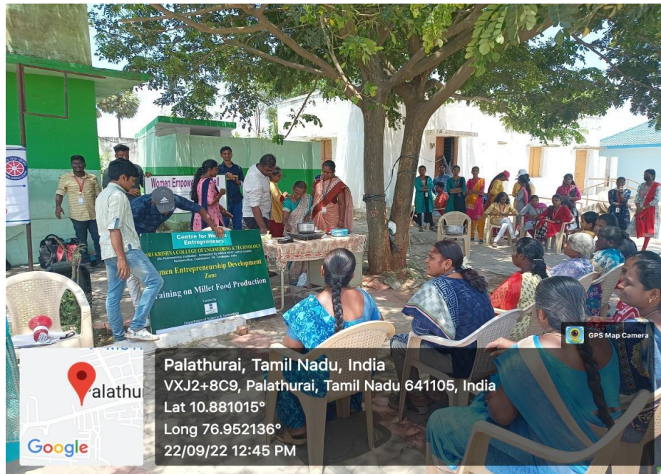
Training on millet food production at Palathurai village – Healthy living on 22.09.2022