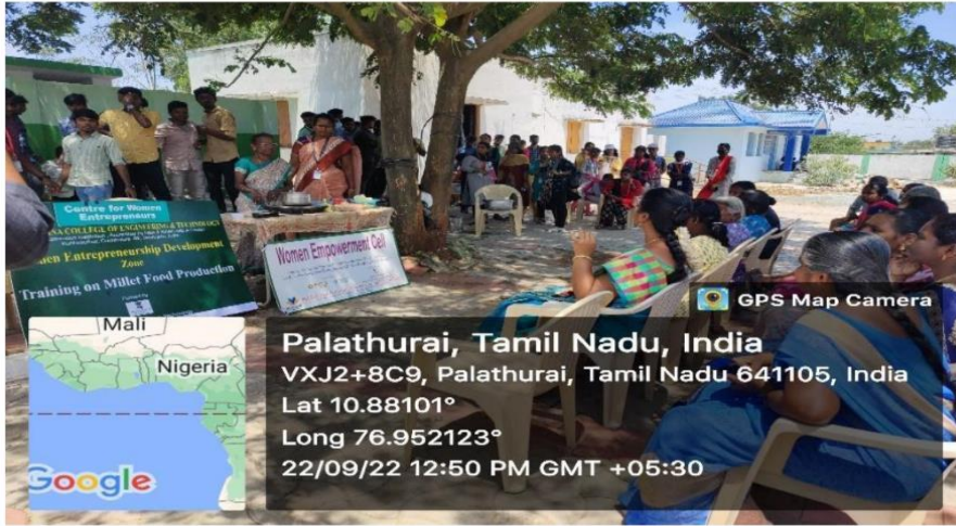
Training on millet food production at Palathurai village – Healthy living