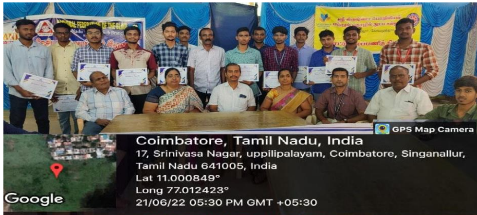
The Students Volunteers were awarded with Merit Certificates for their contribution to the Visually challenge people