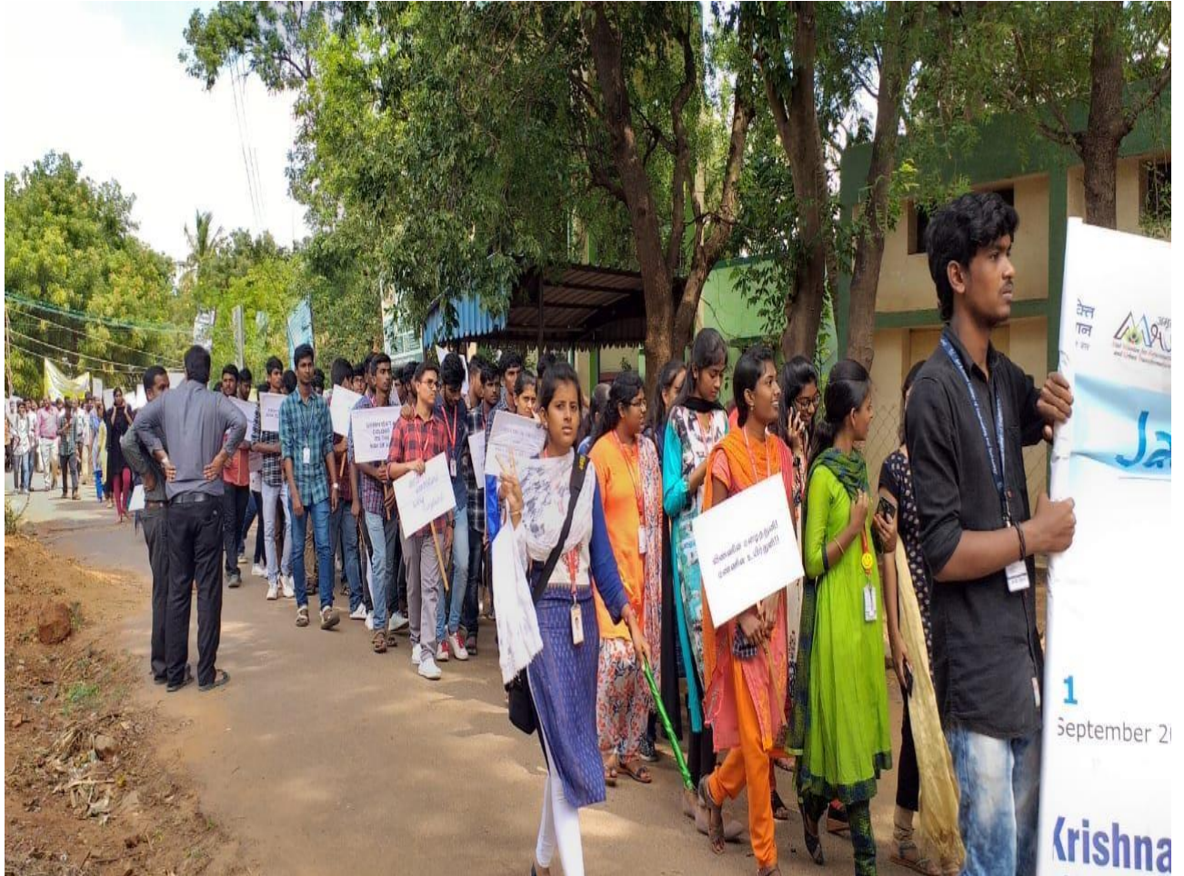
The rally group at the Madhampatti Panchayat