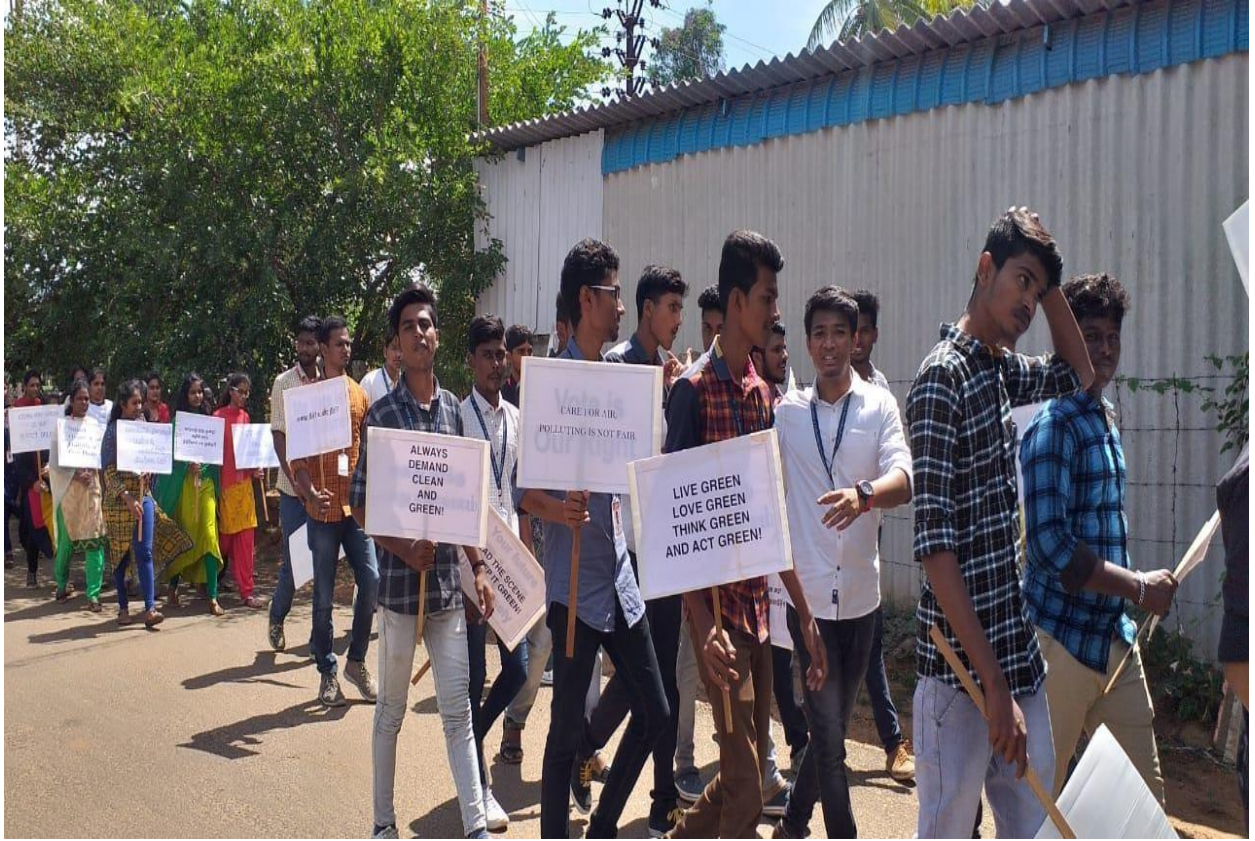
Students walking around the streets of Madhampatti village