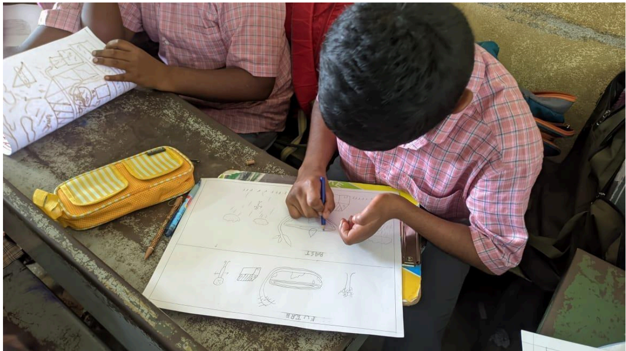
Students performing art on the theme Water Conservation